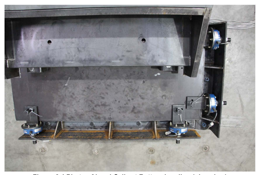
Figure 2.4 Photo of Load Cells at Bottom Landing (plan view)