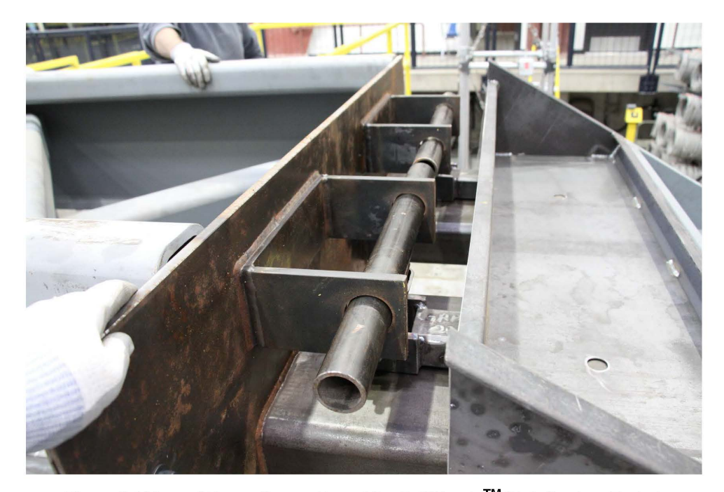
Figure 2.5 View of Upper Connection of the DriftReady<sup>™</sup> Stair System Tested

The AP4 stair system was fixed (bolted) at the bottom landing and supported vertically at the top landing by tube section cantilevers extending from the landing. In the longitudinal direction, rigid links restrained the top of the stairs from moving beyond the end of the cantilever support. In the transverse direction, the steel tubes are free to move through the brackets attached to the top landing. The length of the rigid links and the clearance between the rigid links and the support brackets are sized to allow movement in excess of the maximum expected displacement in either direction. Figure 2.5 shows the top assembly of the AP4 stair system.