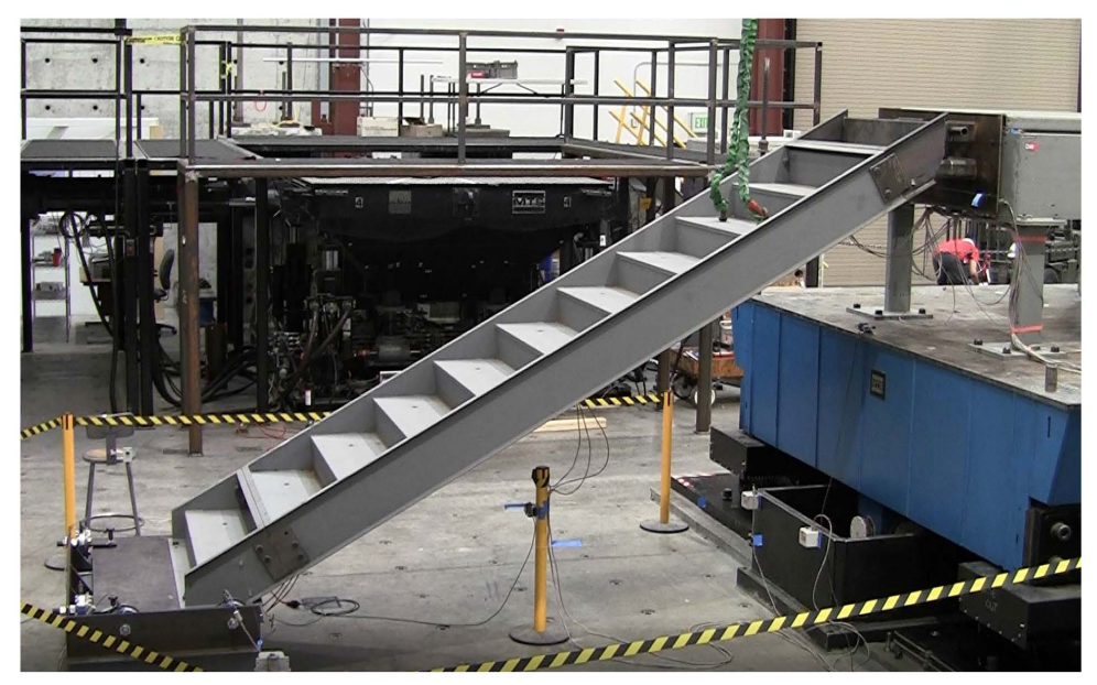
Figure 2.1 Testing Machine with Stair System Installed