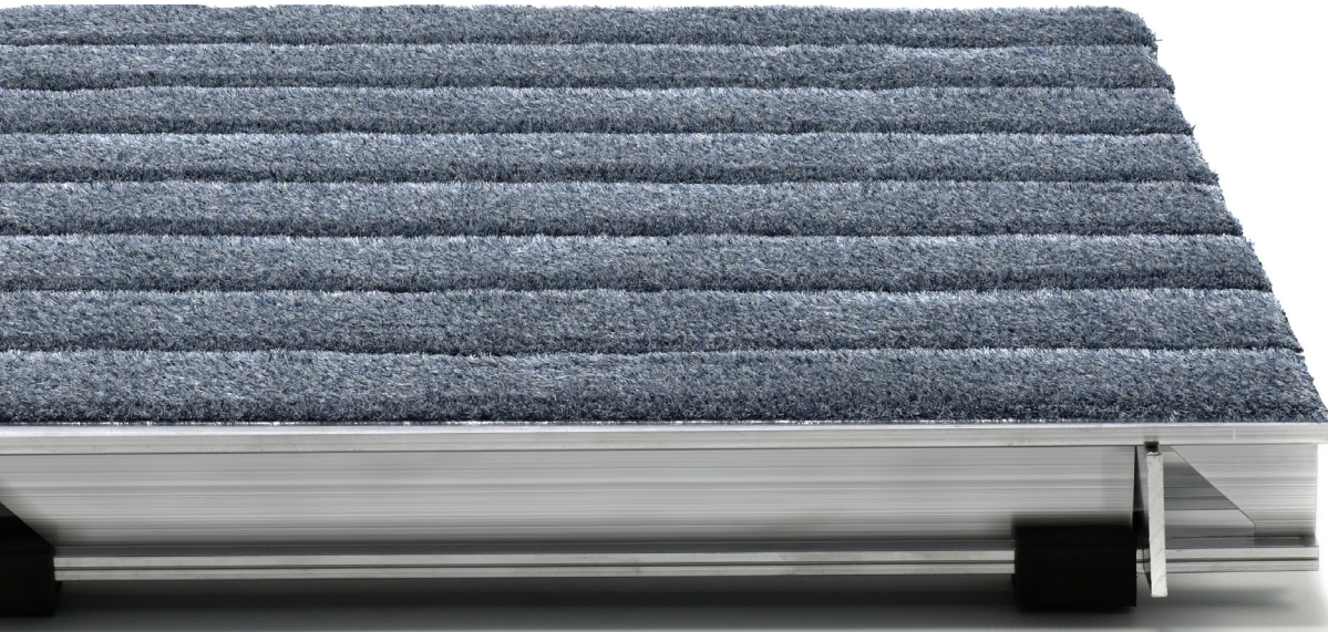
Model Pedigrid G1

Stop dirt at the door with durable Pedigrid flooring systems. Ideal for high-traffic areas, these aluminum recessed grids with scraping capabilities enhance traction and trap large amounts of dirt, mud, slush and snow. With many aesthetic choices, Pedigrid looks as good as it performs.