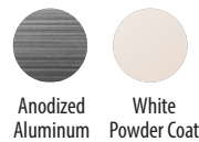
Anodized Aluminum White Powder Coat