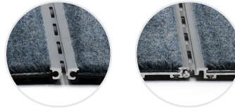
Pedimat M1 PET-G Rails & Aluminum Hinge Connectors