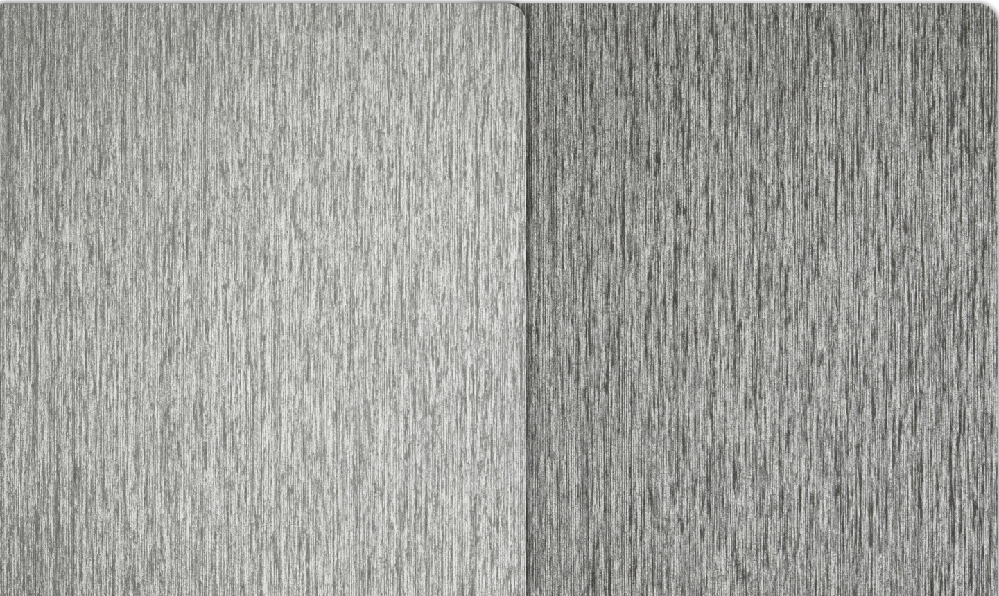
From left: Brushed Pewter and Brushed Graphite

Get the appearance of authentic metal without the price tag. Acrovyn Brushed Metals are perfect for spaces where the durability and cleanability of Acrovyn are required and a lustrous brushed metal finish is desired. Additionally, they're now available with Up to 50% post-consumer recycled content. Select from two different metals to complement feature walls, entries, lobbies, and more.