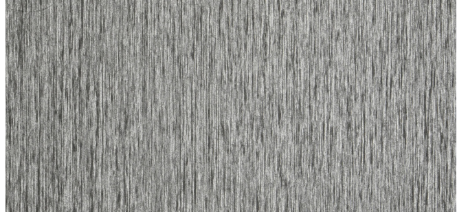
1745 Brushed Graphite