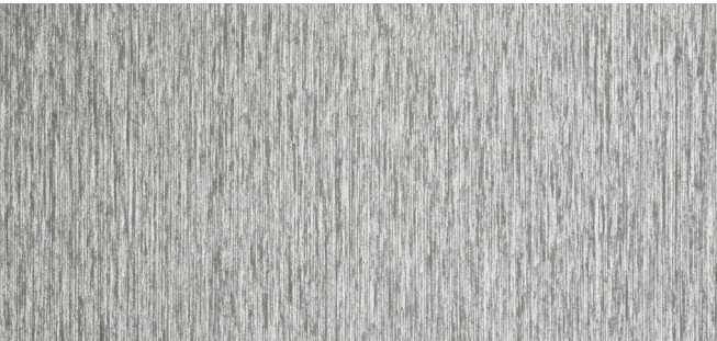
1744 Brushed Pewter alternate to 410 Brushed Silver