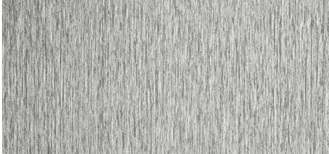
1744 Brushed Pewter