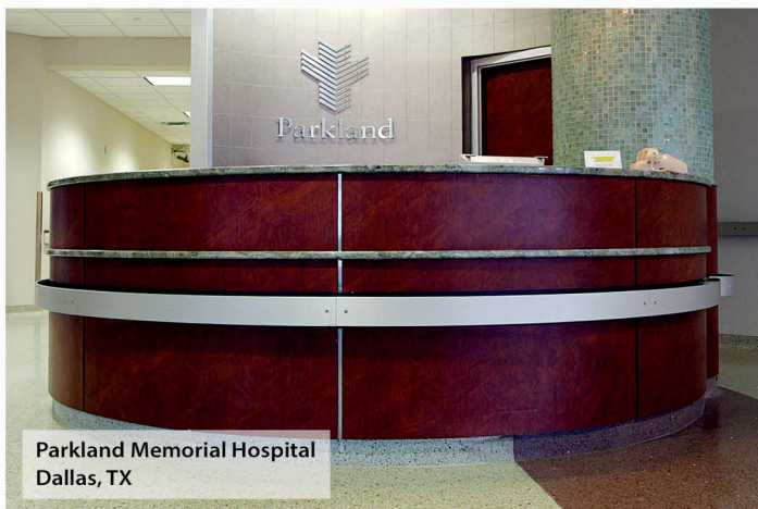
Parkland Memorial Hospital Dallas, TX

Acrovyn® wall guards, wall panels, rigid sheet and the Saratoga® wall system can prevent unsightly damage. These products are available in a variety of materials, colors and patterns for any interior. Acrovyn® by Design rigid sheet incorporates imagery, patterns, branding and more. (See top right photo.)