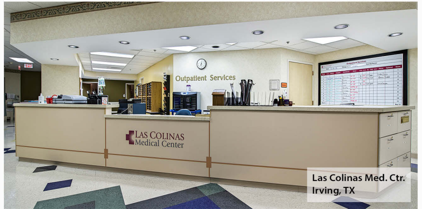
Las Colinas Med. Ctr. Irving, TX