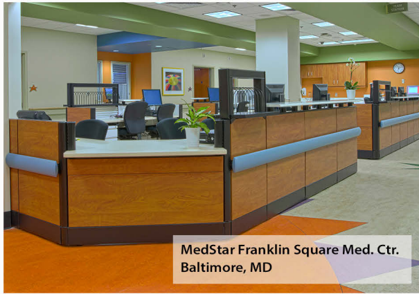
MedStar Franklin Square Med. Ctr. Baltimore, MD