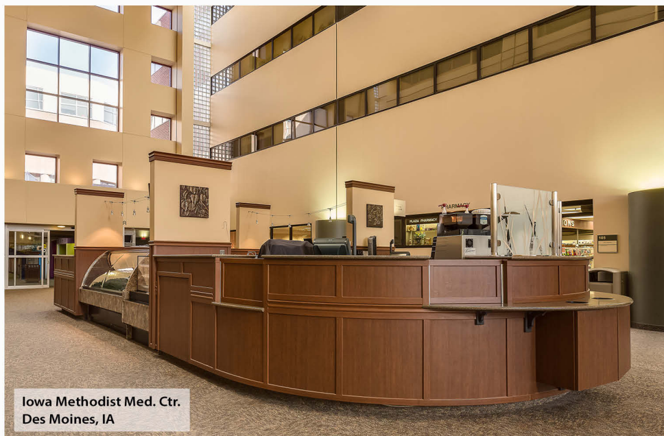
Iowa Methodist Med. Ctr. Des Moines, IA

Call 800-233-8493 and let our staff assist with your design ideas to help make the ideal lasting impression for your next project.