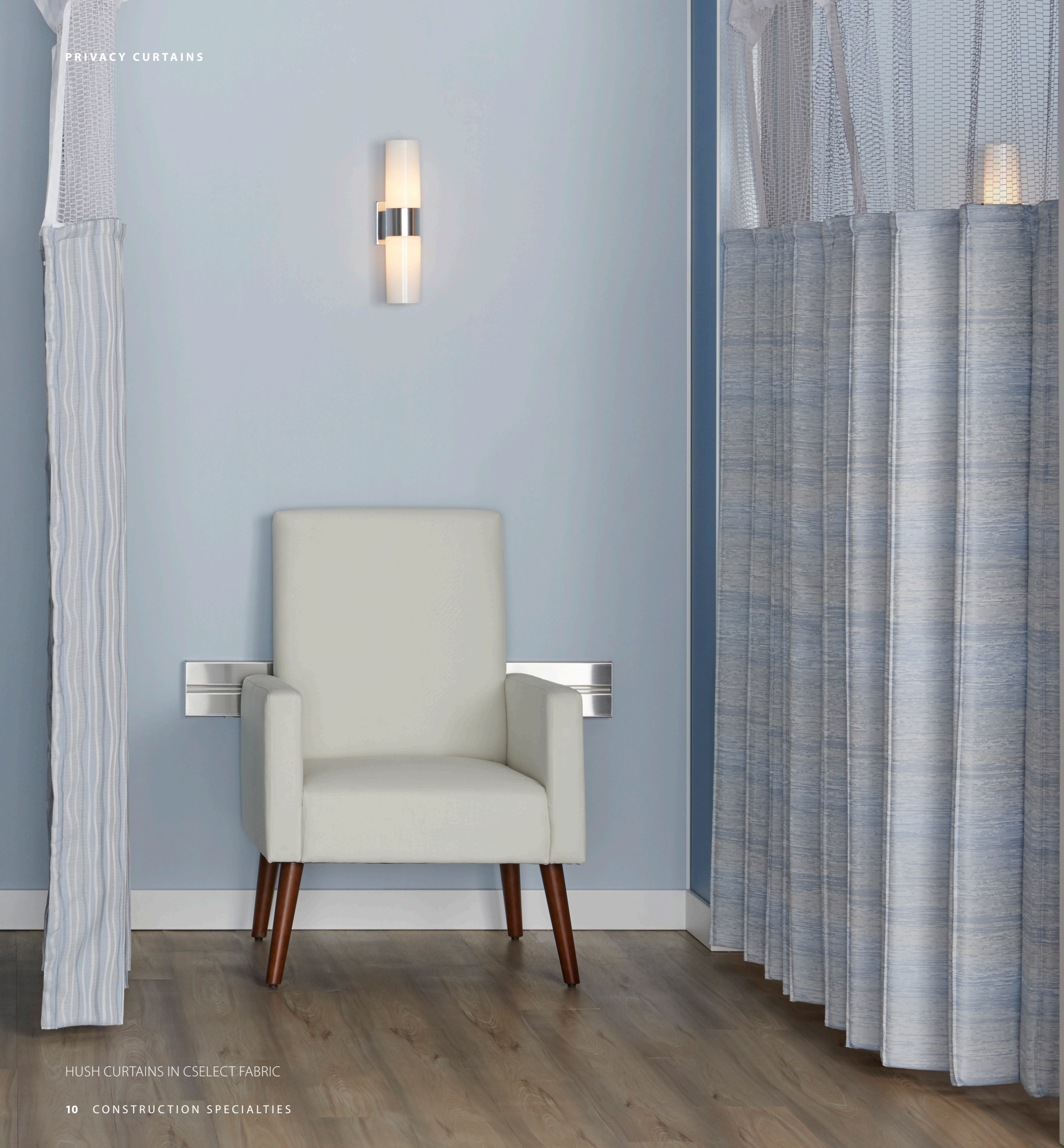
HUSH CURTAINS IN CSELECT FABRIC