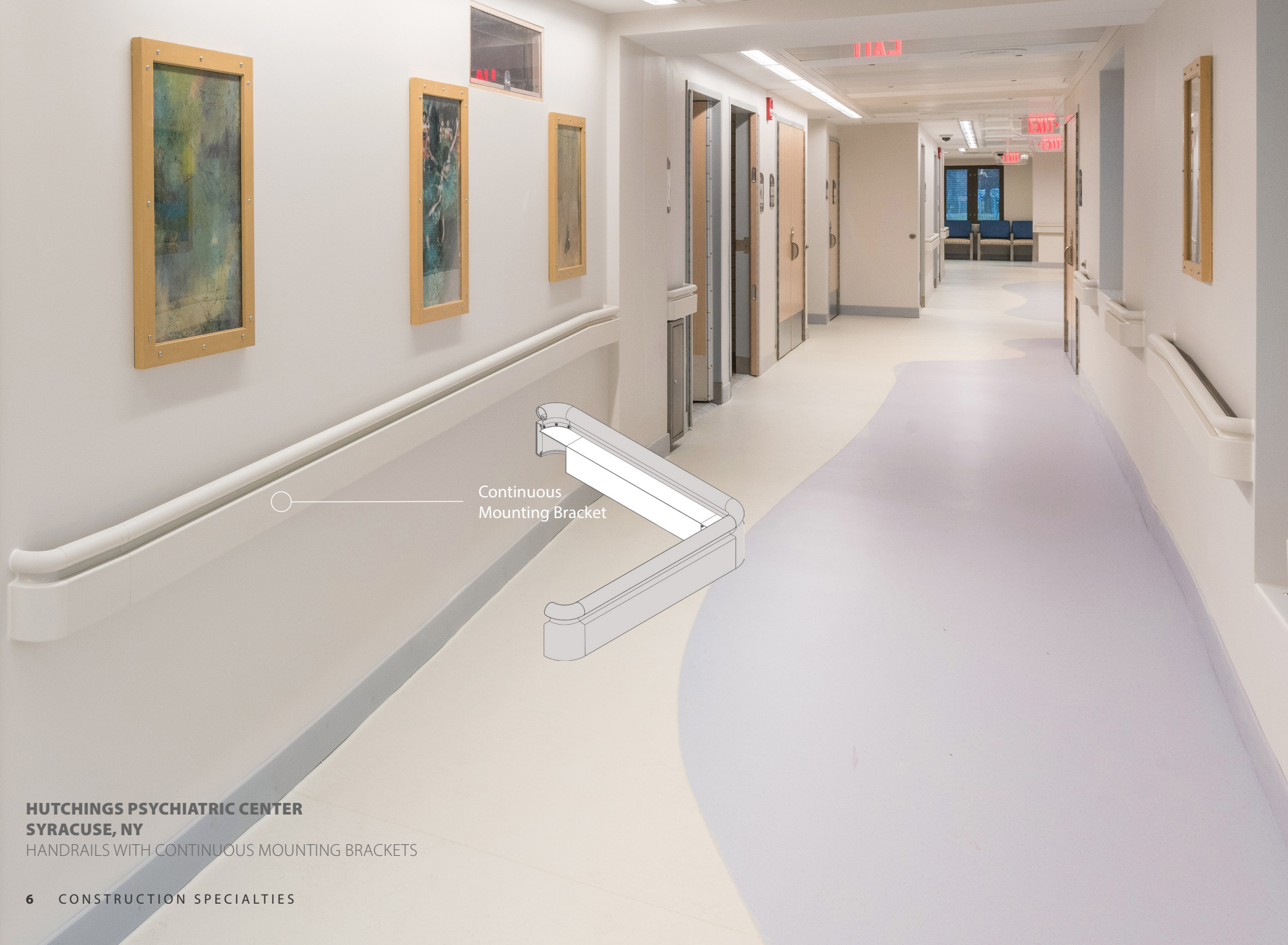
HUTCHINGS PSYCHIATRIC CENTER SYRACUSE, NY HANDRAILS WITH CONTINUOUS MOUNTING BRACKETS

Handrails can be the difference between mobility and immobility for patients, making them important in all healthcare settings. As with many other products, handrails for behavioral health need to take an extra step in patient safety—which is why we offer features like continuous mounting brackets.