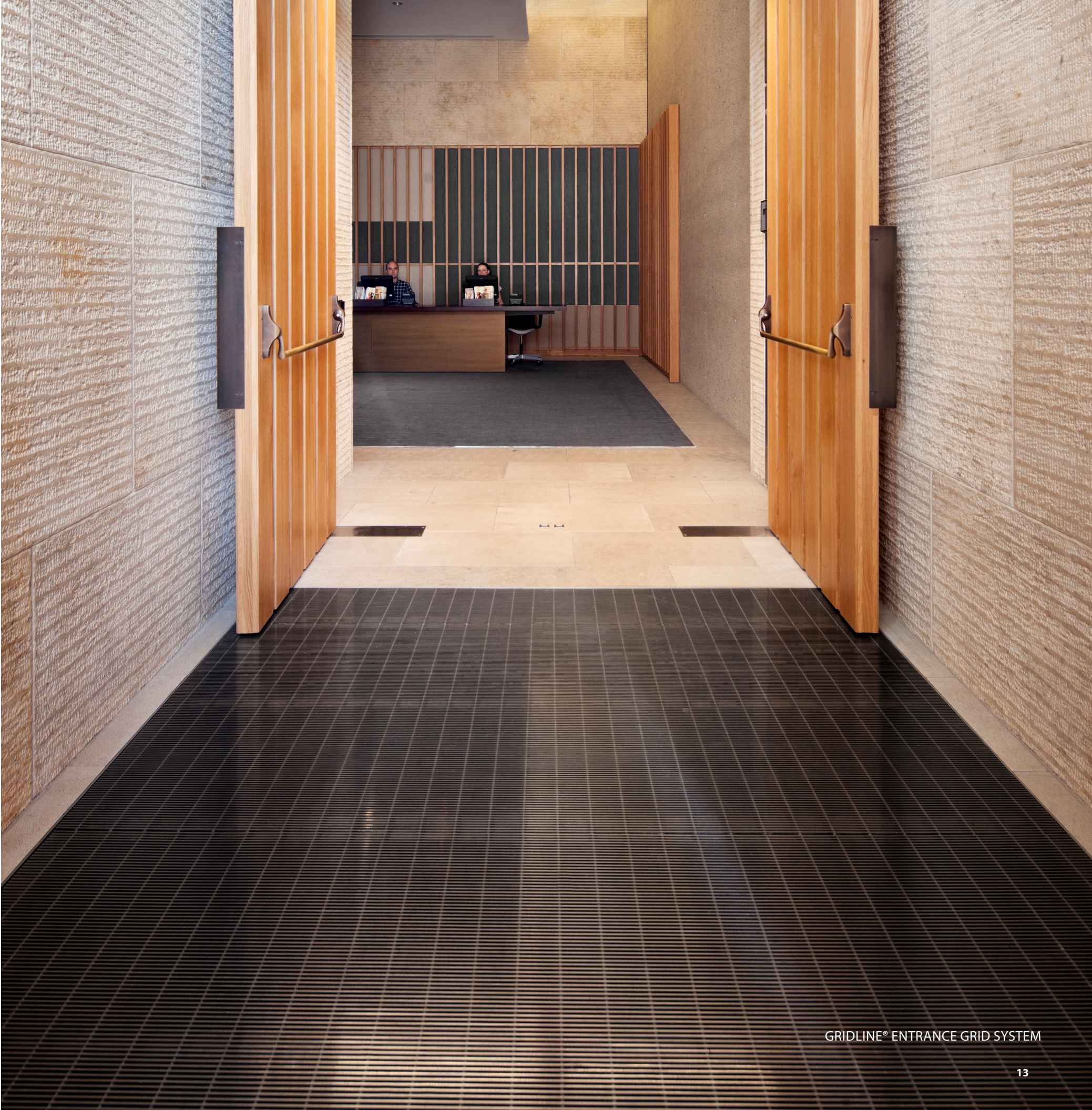
GRIDLINE® ENTRANCE GRID SYSTEM