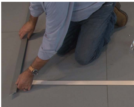
4 Apply the frame to the substrate.