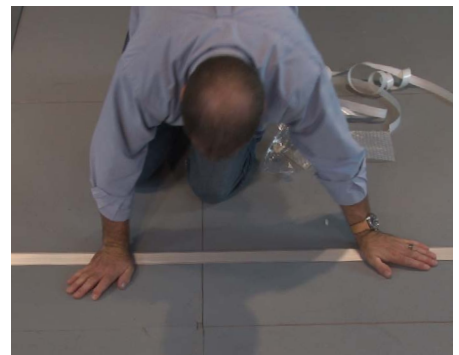
6 Firmly press down on the entire length of the frame to activate the tape.