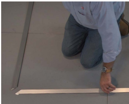
1 Begin by placing the pre-mitered tapered aluminum frame in the correct location.