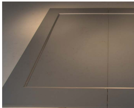
2 Prepare the finished floor surface to allow the tape to properly bond to the floor.