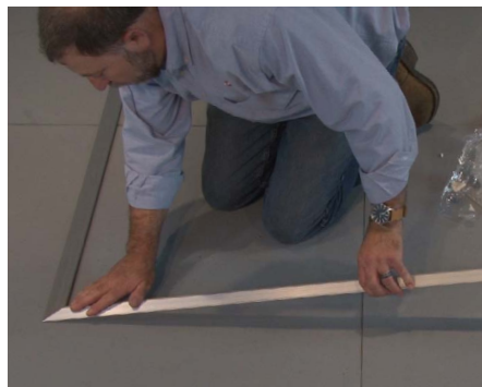
5 Make sure the frame is square and the miters butt properly.