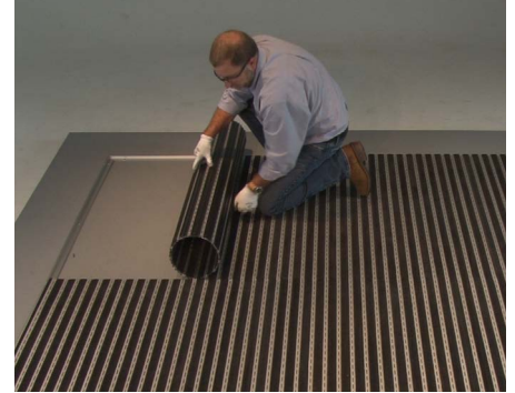
18 Care & Maintenance: to properly clean underneath the mat and avoid rail damage, roll back the mat edge to the 12th rail. Continue to roll back the mat holding that diameter.