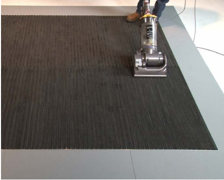
16 Clean the unit with a vacuum.