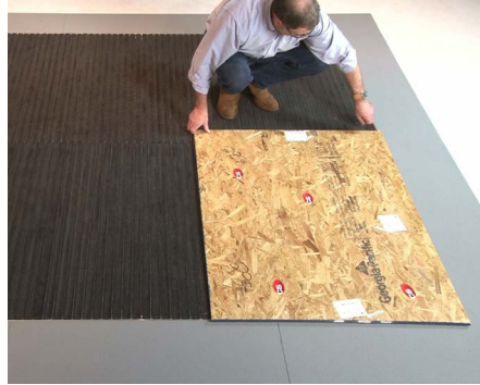
17 If construction is to continue in the building, protect the unit with plywood sheathing.