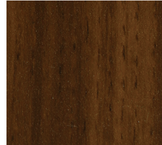
017 American Oak