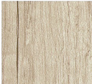
020 Scrubbed Walnut