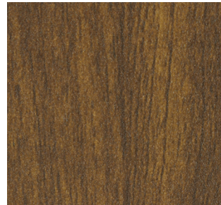
011 Warm Walnut