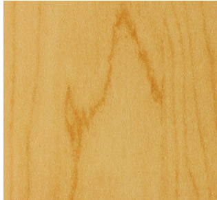
002 Hard Maple