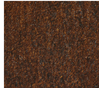
021 Oxidized Bronze