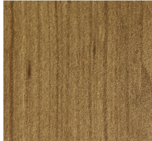
022 Vanilla Ash