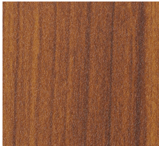
009 Black Cherry