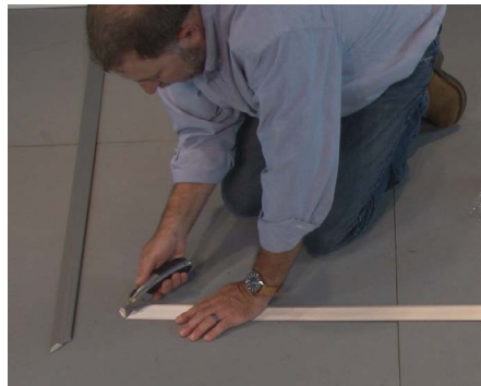
2 Prepare the flooring surface to allow the tape to properly bond to the floor.